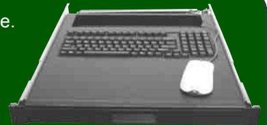
(Mouse is optional)