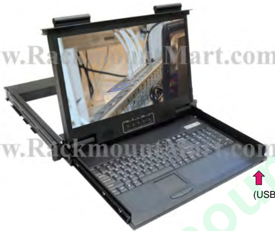
(USB Port for single-port model only)