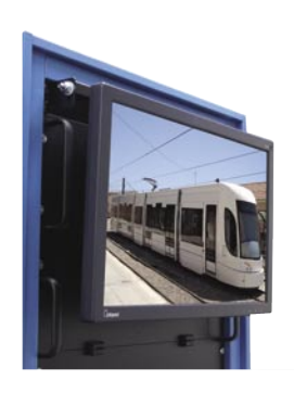
monitor tilts up.