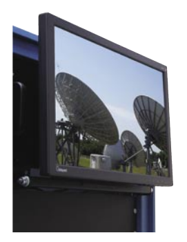
Monitor tilts down.

The bracket occupies 1U (1.75") of vertical rack space and may be mounted so the monitor tilts in the up or down direction. Mounting the monitor to tilt in the down direction allows monitors with limited vertical viewing angles to be mounted higher in the rack then tilted down to allow for optimal viewing. If stationary equipment is installed in the rack (does not slide in/out) the RDMB-1U01 can be mounted directly over the mounting holes on the stationary equipment and thus occupy no vertical rack space.