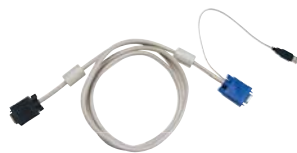
USB 2-in-1 KVM cable 6ft, 10ft & 15ft available