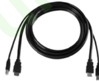
LCD-A3012 HDMI KVM cable, 6 ft 2K 60Hz