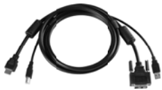
LCD-A3011 DVI-D KVM cable, 6 ft 2K 60Hz