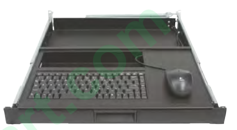
Shown with optional mouse