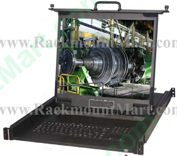
(USB Port for device access)