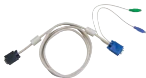
PS/2 3-in-1 KVM cable 6ft, 10ft, 15ft & 33ft available